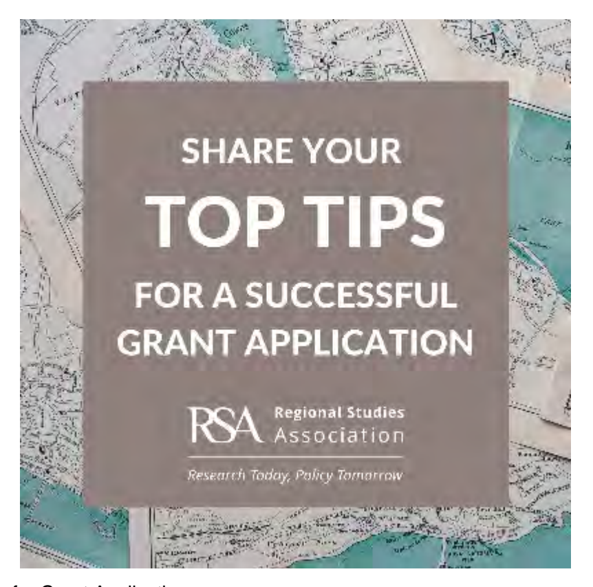
Top Tips for Grant Applications

These filter buttons can be found on all our pages and can be useful if you want to narrow down a search to a specific geography or page type.