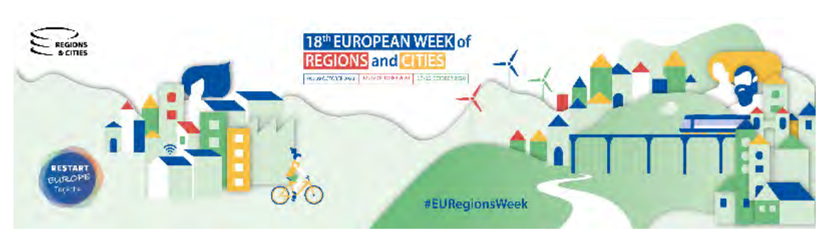
#EURegionsWeekCollege & #EURegionsWeekUniversity: Registration deadline has been extended

More information can be found on the RSA Europe website.