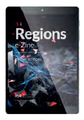
Regions e-Zine Issue 7: Financialization of the Urban and Regional Domains

The period between the publication of <u>Issue 6</u> and the launch of this <u>Issue 7</u> has been challenging across all sectors of society. The challenges caused by the COVID-19 pandemic have affected work-home relationships, have changed the way we travel, communicate and socialize. It has also called for a rethinking on how to respond jointly in terms of solidarity and cooperation. It is somehow a chance to utilise this moment to act and draft more inclusive and sustainable policy, national and regional development strategies. In this context, financialisation plays a fundamental role.