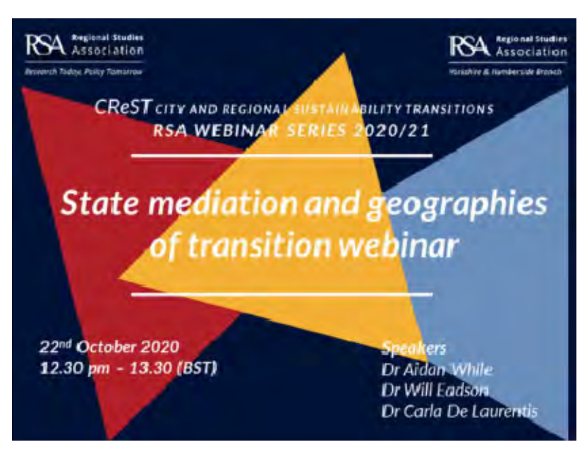
RSA City and Regional Sustainability Transitions (CReST) Webinar

This seminar series will invite leading scholars from across these fields to present cutting edge theoretical and empirical work. Through stimulating discussion and debate about ways forward for understanding economic geographies of sustainability transitions, policy and academic communities can be brought together. In the first of the series' <u>State mediation and geographies of transition</u>', the speakers include Aidan