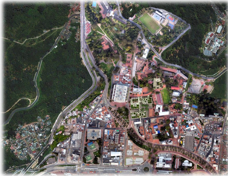
Bird-eye view Universidad de los Andes

We will depart at 08:00 from the main entrance of the Santo Domingo (SD) building (before the Welcome to the conference at 09:00). We will see some of the highlights of the university campus, which is located in the Andes mountains. The tour will end again at the Santo Domingo building where you have registered before and will now attend the Welcome to the conference and opening plenary session.