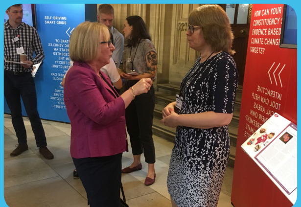
Maggie Throup MP at the 'Antimicrobial resistance' pod