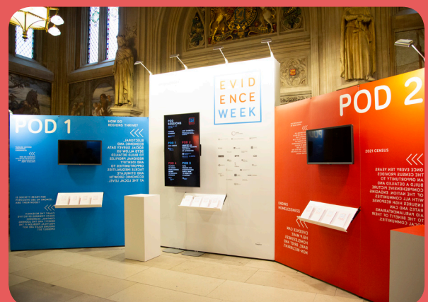
Thank you to Soapbox for the pod design