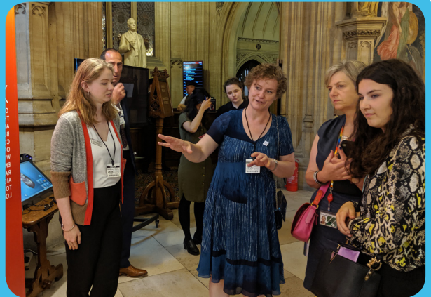
Lilian Greenwood MP at the 'Virtual human' pod