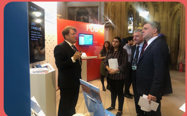
Jim Fitzpatrick MP at the 'Understanding the psychology of road users' pod