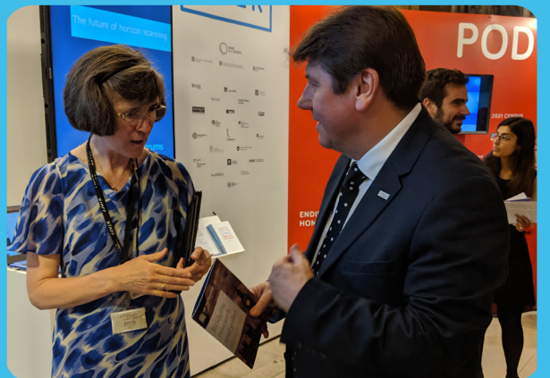
Stephen Metcalfe MP at the 'Census 2021' pod