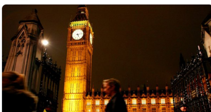
Today in Parliament - 28/06/2019 - BBC Sounds News, views and features on today's stories in Parliament bbc.co.uk

Last week we ran #EvidenceWeek in the UK parliament. The BBC asked MPs why they came: