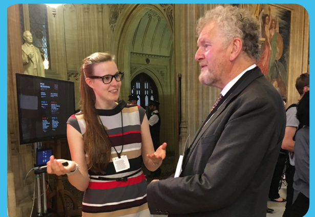
Lord Lucas at 'The impact of automation' pod