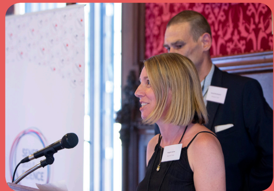
Shannon Trust declaring why evidence matters to them in their mission to teach adults in prison to read