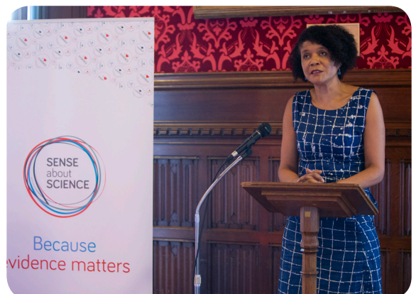
Chi Onwurah MP at the Evidence Week opening event