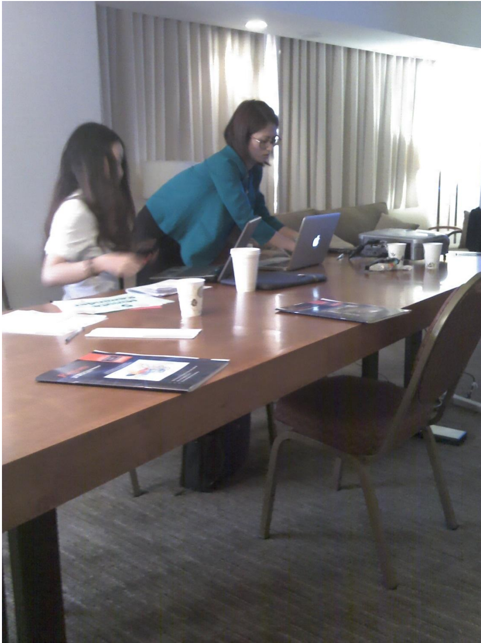
Marketing in my special session