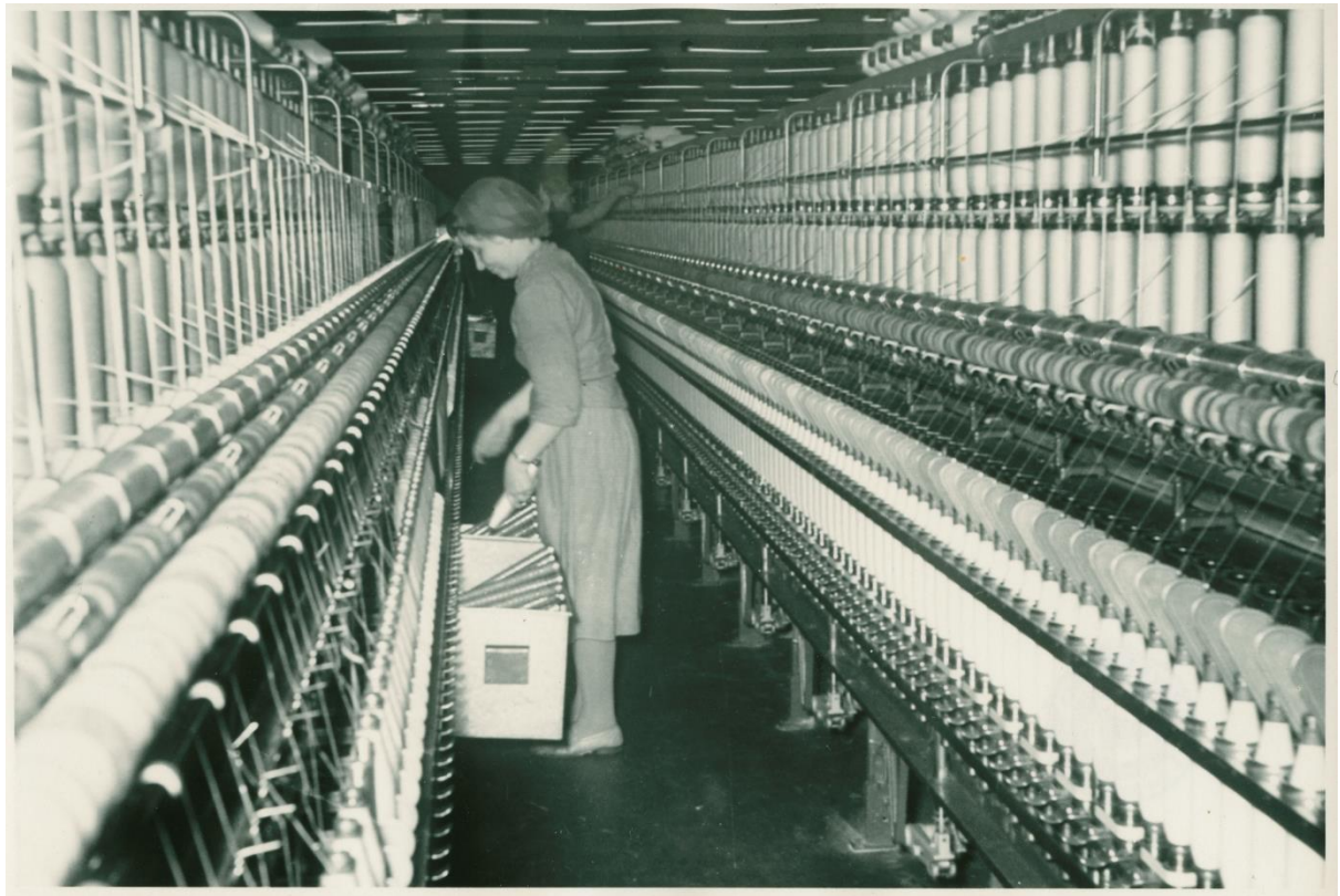
A worker and a spinning machine in Porin Puuvilla, 1937.

Anyone interested in participating in the session should register for the conference before 24th February 2017 by visiting http://www.regionalstudies.org/conferences