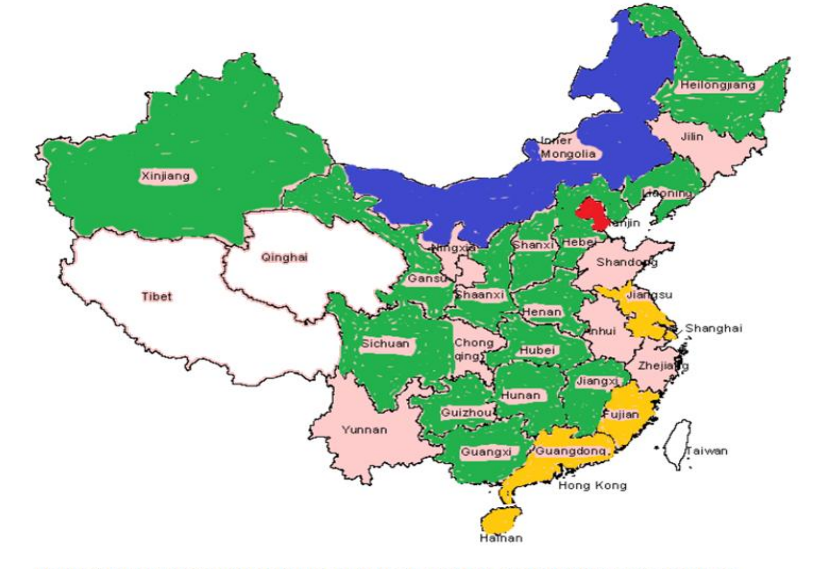
Figure 3 Fitness comparisons between national, regional, and local innovation systems

2. No data available for Tibet and Qinghai;